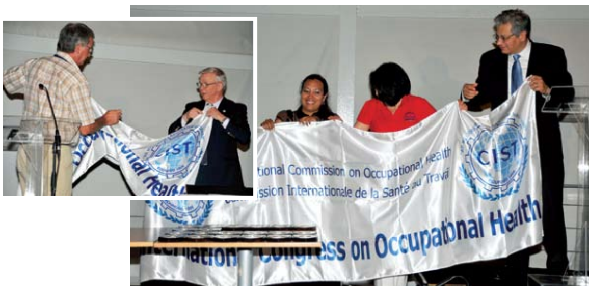
ICOH General Assembly II on 27 March 2009