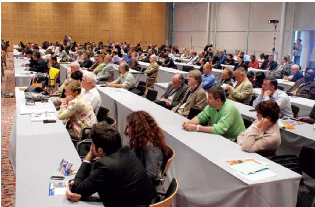
ICOH General Assembly I on 22 March 2009, Cape Town, South Africa